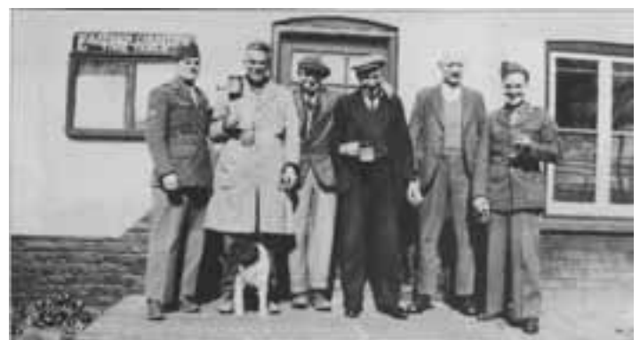
Sharing a few pints with the locals – mostly middle-aged and pensioners; the young men were in the services continued overleaf

Alas, Forrest doesn't mention the name of the pub. Anyone know?