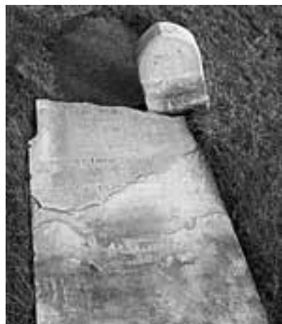
The damaged Turney family memorial stone