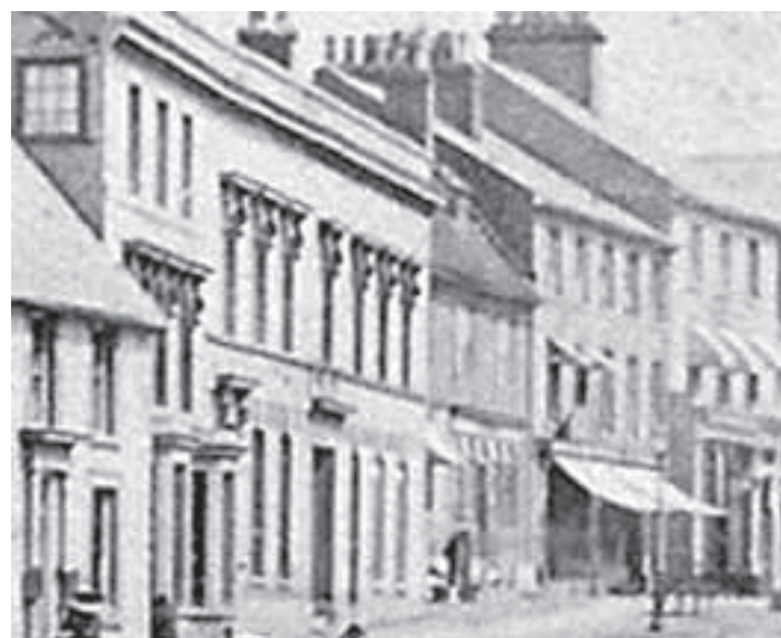
Bassett's Bank was perhaps part of this building, the present Barclays site 1870

In 1884 a sub-branch was opened in Toddington.