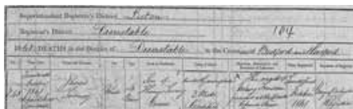
James Turney's death certificate showing death caused by acute hydrocephalus