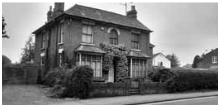
Ivydene House, Bedford Road, Houghton Regis

The house which we said had disappeared was next door, opposite the old vicarage, separated from its neighbour by a large grassed plot. It was called 'Brooklyn' or 'Brooklyn Vill'. Ms O'Connell remembers that it was set high up and back from the road, with a brick wall and steps leading up to the front door, with a large arch to the left, big enough for a carriage to enter. There was a cobbler's workshop and outbuildings situated there. The site is now used for old people's accommodation.