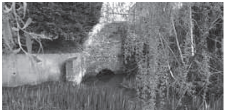
Photograph of the bridge today, taken from a garden opposite Moor End House

Today all that remains of the mill is a water feature, utilising the mill stream, marking the spot where the water wheel once stood. Albert Bunker's house, which stood close to the mill and narrowly avoided being destroyed by the fire, still exists.