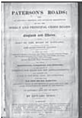
Patterson's Roads describes the principal roads in the coaching era