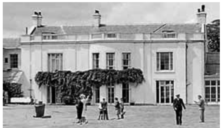
A fete at Tingrith Manor in 1947