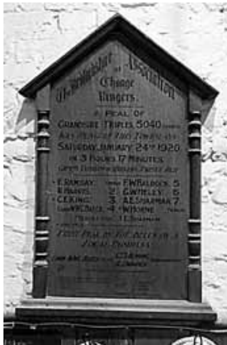
The post-war peal board that hangs in the ringing room showing the names of the bell ringers