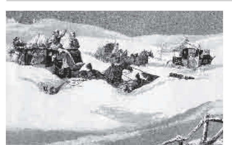
'The Holyhead and Chester Mails at Hockley Hill, near Dunstable' by Henry Thomas Alken