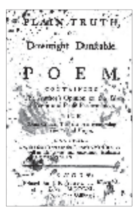
Dunstable, published in 1790

'Downright Dunstable' is, in fact, the first item in a book which is a bound collection of poems, pamphlets, satires etc from the first half of the 18th century. The longest piece is called 'The Pulpit Fool, a Satyr' Title page of Downright from 1707. The tone of the volume is a