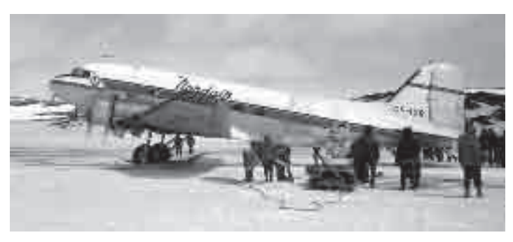
The DC-3 Dakota CF-1QR which crashed in the Arctic

One aircraft, numbered CF-IQR, was a DC-3 (Dakota) built for the United States Air Force by the Douglas company in 1943. After the war it was used in Northern Canada by a number of operators and was being flown