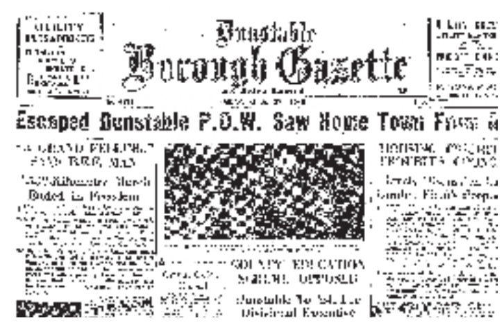
The Dunstable Borough Gazette of 27th April, 1945

The Gazette's front page on April 27 1945 had a banner headline saying "Escaped Dunstable POW Saw Home Town From Air".