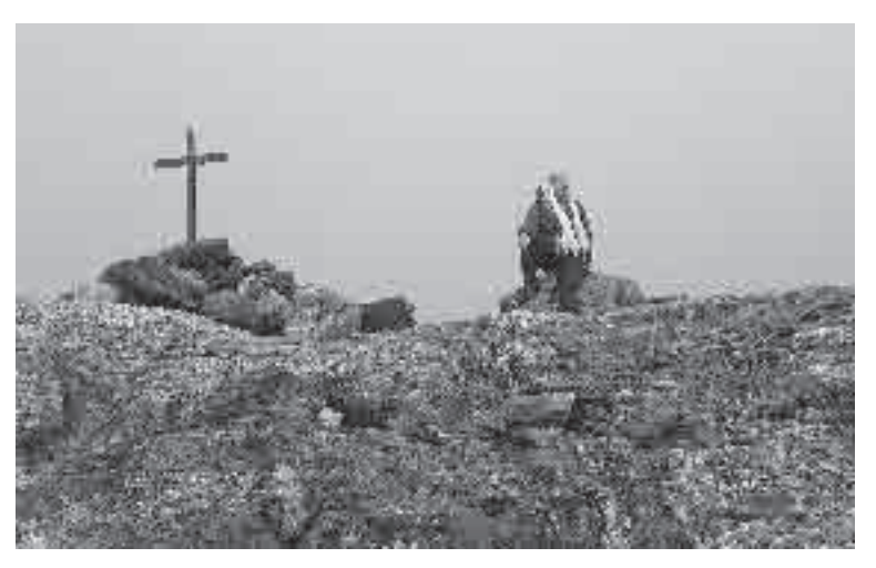
The photo of a memorial at Salluit, Canada, commemorating the death of four people in an air crash

Well, it is a particularly interesting example of how far and wide the Society's website is now spreading. Its pages are being opened hundreds of times every day and the site generates dozens of queries every month.