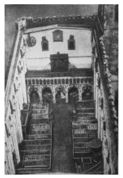
Model of the Priory Church circa 1839

During the interval of my talk, one member of the audience, who had been a choir-boy in the Priory Church, could not accept that the screen had been in any position other than its